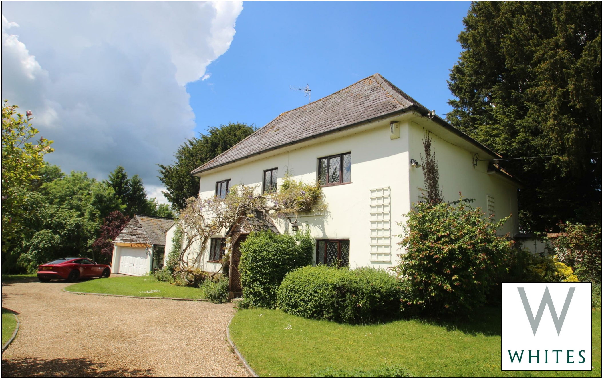
Primrose Cottage, Netton, Salisbury, Wiltshire, SP4 6AW